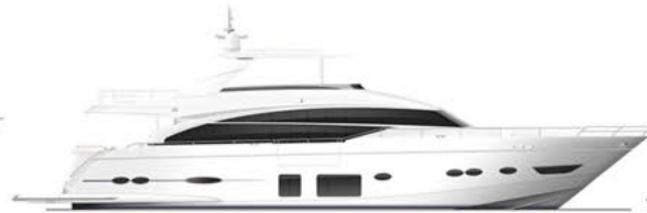
88 Motor Yacht