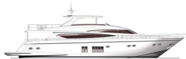
98 Motor Yacht