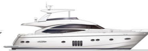
72 Motor Yacht