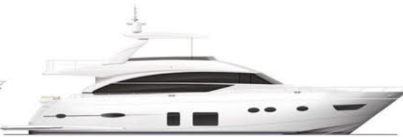
82 Motor Yacht